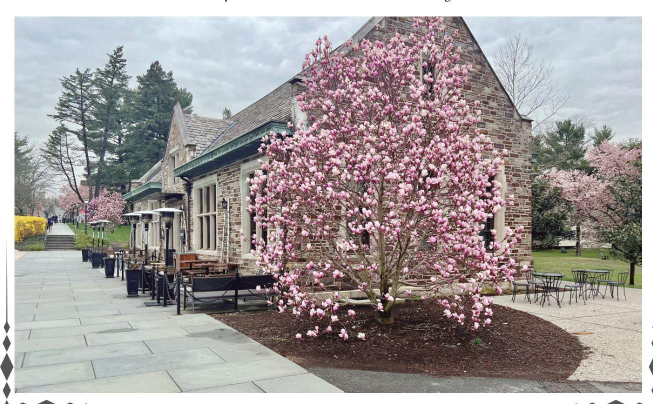
This space can be included in the buyout