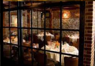
PRIVATE ROOMS STONE ROOM - 24 ROOTS ROOM - 56